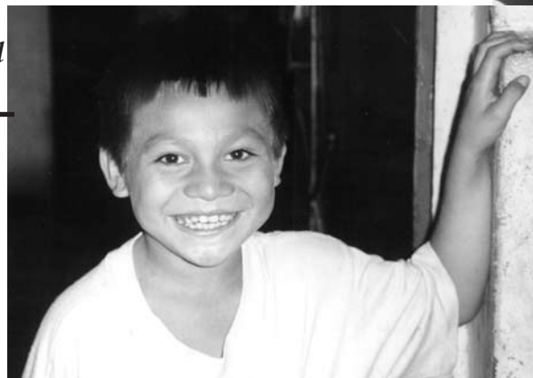
Mountain village of Arcatao.

Q How is the money for our sister parish being used?