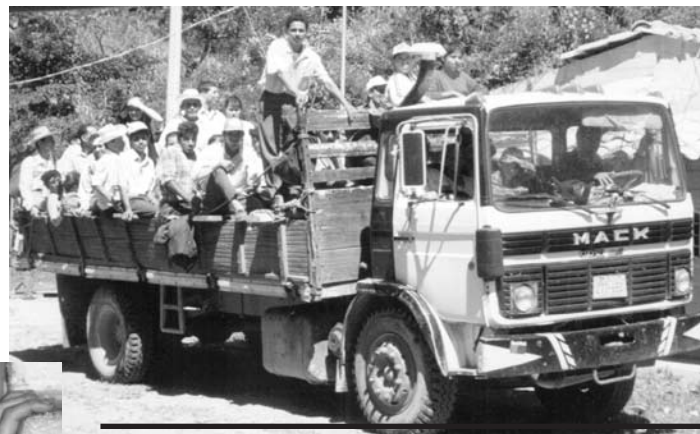
Layworkers arriving for pastoral training.